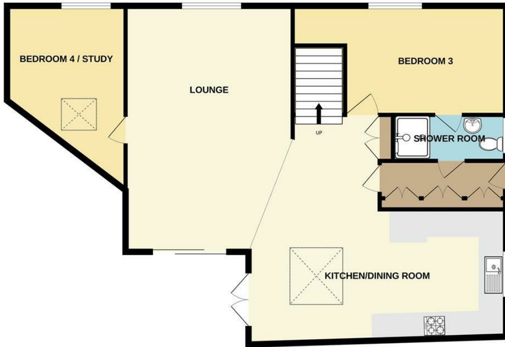
GROUND FLOOR 1164 sq.ft. (108.1 sq.m.) approx.